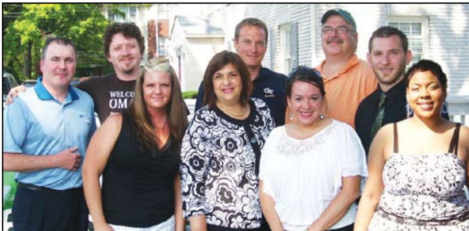
The Revved Up and Maxed Out Charlotte Team.

Actually, overall revenue was up, prime cost was down (that's a good thing), Omaha SteakHouse flourished, and life was good in the Queen City. At the net income line, they missed budget by a whisker but jammed a fifteen percent increase over prior year. After celebrating, Team Charlotte noticed a steep increase in the price of Tanqueray due to a sudden supply/demand imbalance.