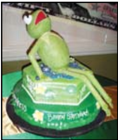
Kermit Cake from Frosted Art Bakery.