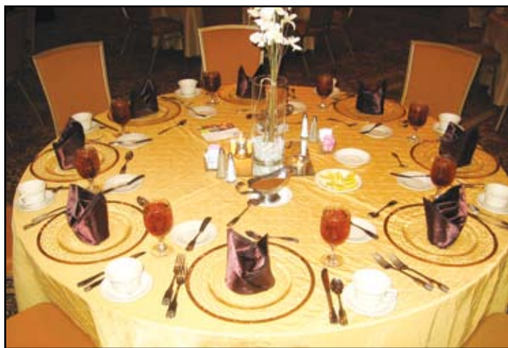
NACE Luncheon Place Setting.

For the tables we borrowed linens and we also borrowed plate chargers which really added a lot of sparkle to the table. The centerpieces are ours. The lunch was a big hit and I think it really put our ballroom and catering on display."