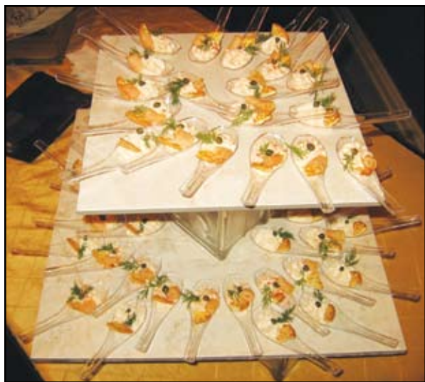
Salmon Mousse Spoons.