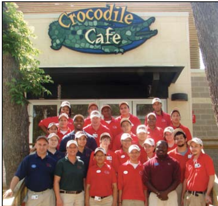
Our wildly enthusiastic Fort Worth Zoo Crew.

The Rio Mexican Grille is the Zoo's private Tex-Mex restaurant offering the Croc Daddy burrito—a large steak, chicken, pulled pork or vegetarian burrito wrapped in a tortilla. The Croc Mama burrito offers the same in a smaller size. Other menu options include the Gator Bowl, a Croc Daddy without the tortilla. Guests can order any of these items topped with grilled vegetables and ... what else ... crocamole!