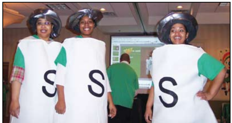
Seasoned Professionals Celebrate Salt Scores.