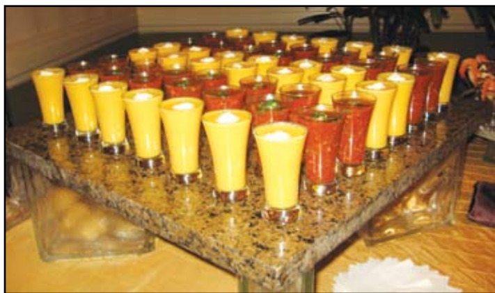
Trendy Soup Shots.