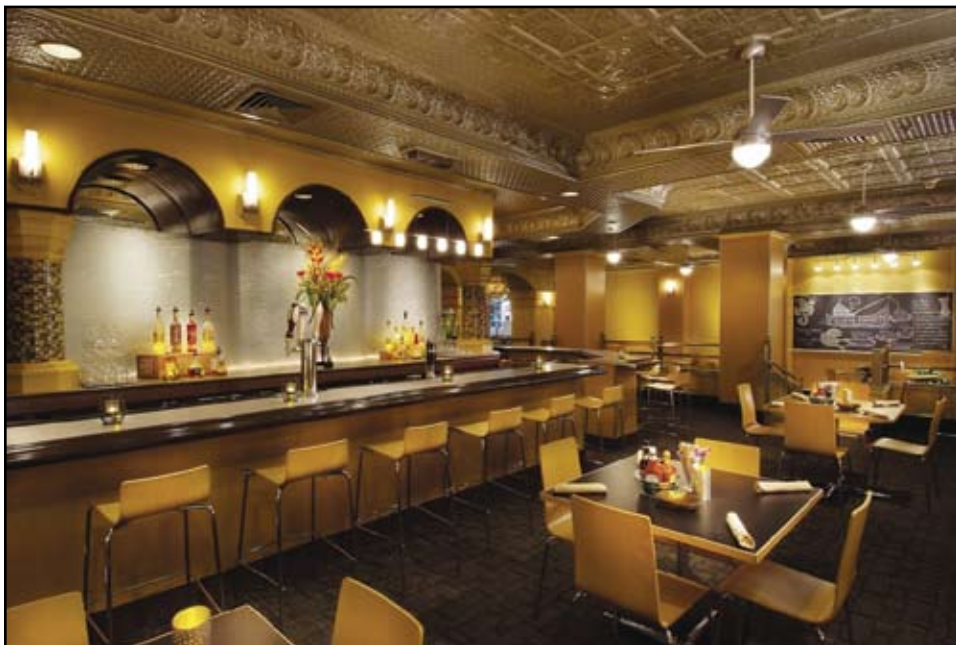
The Newly Launched Fisheye Grill in Orlando.

Some of the most popular menu items include the Conch Fritters with Creole Key Lime Sauce, the Blackened Grouper Salad, and the Min "O's"—tiny Hamburger, Crab Cake, and Fried Fish Sliders.